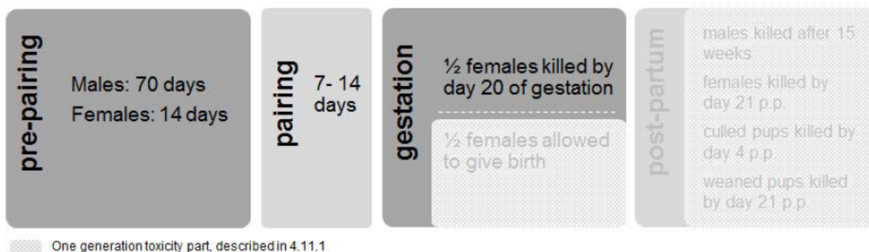
Figure 4 Examinations of the developmental toxicity part